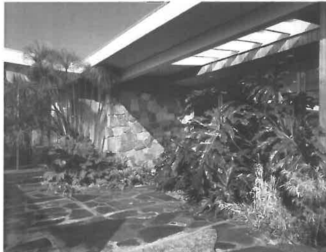
Figure 4. Subritzky Courtyard.

(Bamboo, paw paws, bananas, taro and fatsia) set in a modernist hard landscape of flagstone patio and overhead shade planting. This area was immediately adjacent to the dining room while the design of the rest of the site was more pragmatic and conservative. These gardens were part of the advertising strategy for both Strewe and Palmers. They advertised their design currency, while at the same time providing examples for their clients that were still comfortably within the normal design milieu.