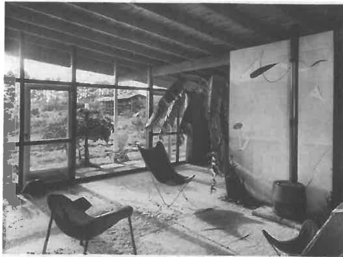
Figure 1. Interior of Strewe House, Great North Road, Glen Eden, Auckland, 1951 (Photographer not known; Strewe Family Archive).

whilst representative of the idea, they do not engage with the more complex issues of modernist landscape design or tropical landscape in a temperate climate.