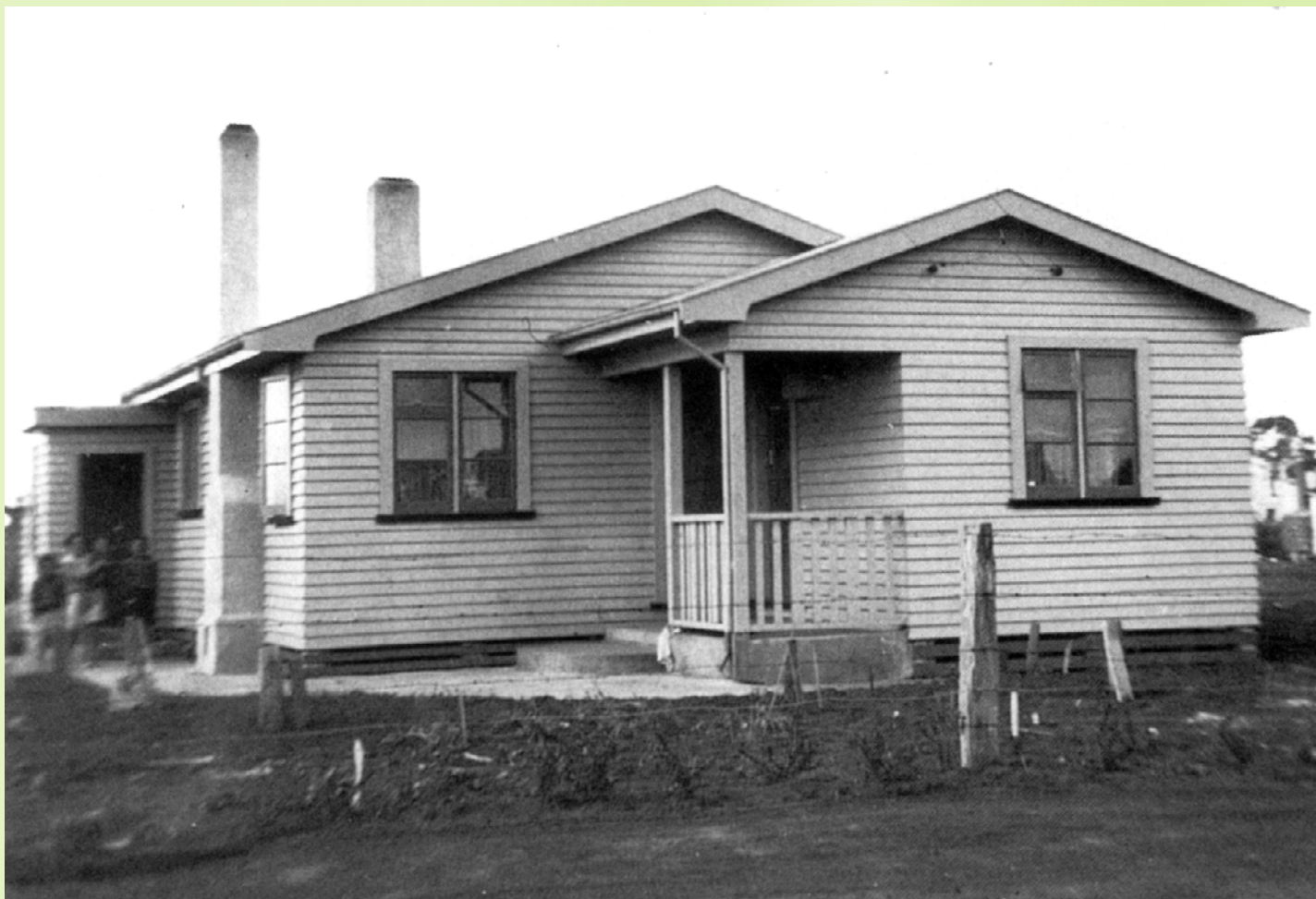
Waitara Late 1940s