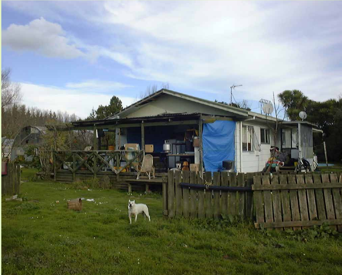
50 Alexander Crescent Otara 2001