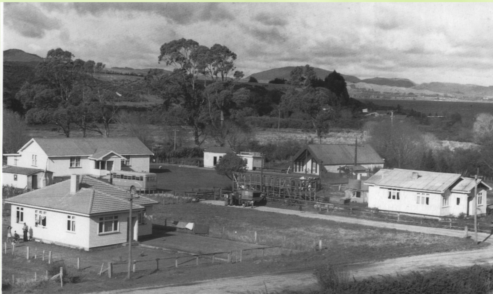
Mourea - Rotoiti 1953