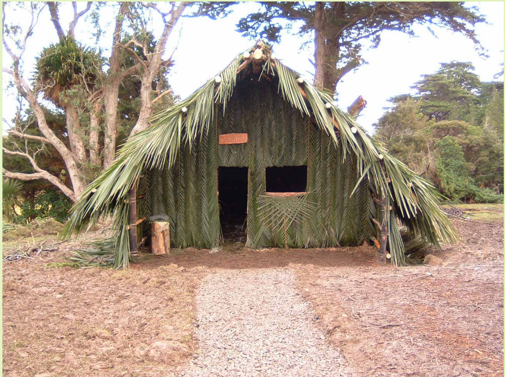
Whare Nikau – Puatahi Marae 2006