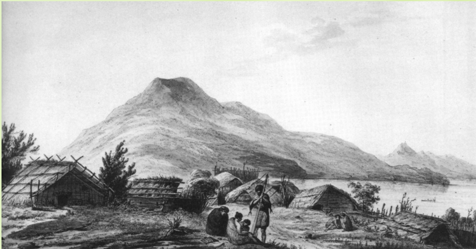
Queen Charlotte Sound 1841