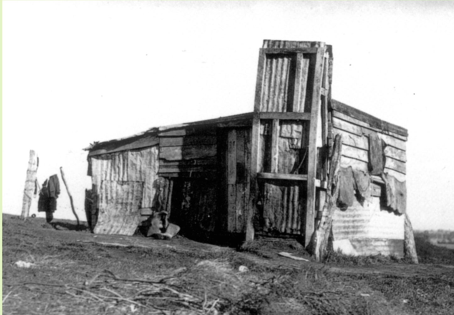
Rural Māori Housing 1930