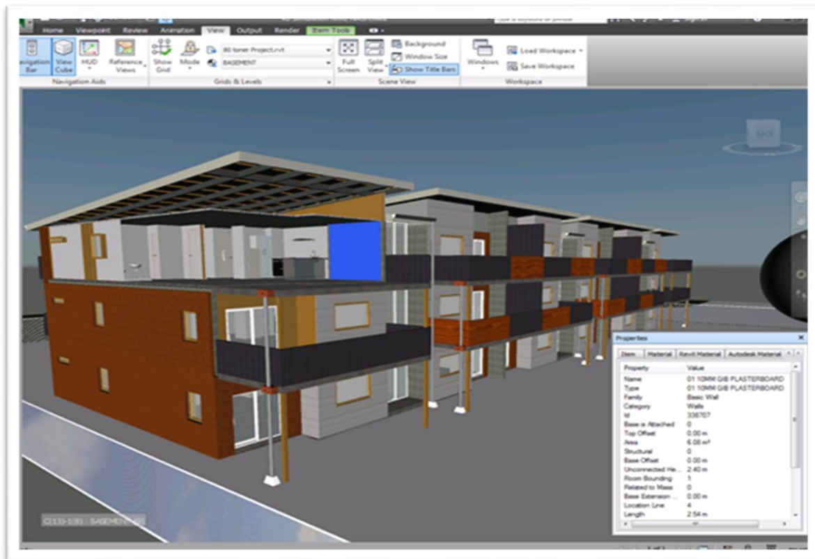
Figure 1. Virtual model of the project in Navisworks Manage.

Action research consists of three recurring phases: inquiry, action and reflection. The cycle of phases can be repeated as many times as needed (MacKenzie, Tan, Hoverman & Baldwin, 2012).