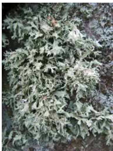
Figure 1. Ramalina canariensis is now At Risk – Declining because of observed deterioration of its population on Chatham Island.

2 TI = Taxonomically Indistinct (see Table 4).